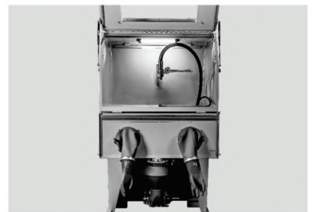
Spacious opening workplace